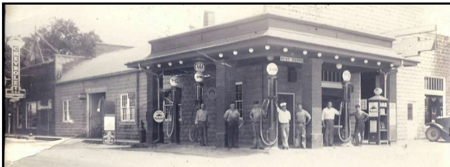
Later picture showing the additions to the North & East