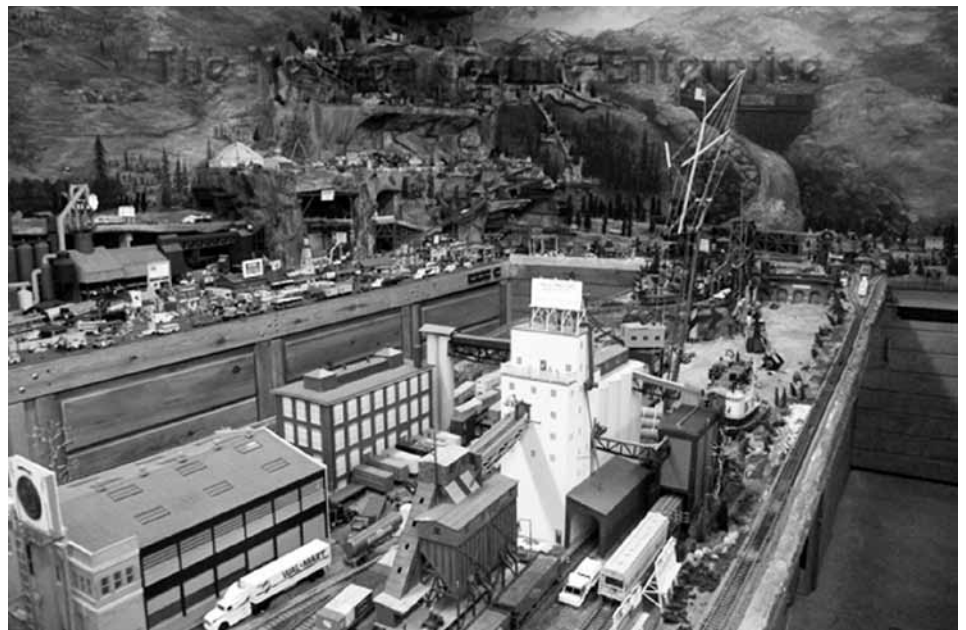
A portion of Wally’s World is filled with cities, towns, people, railroads, and even waterfalls.