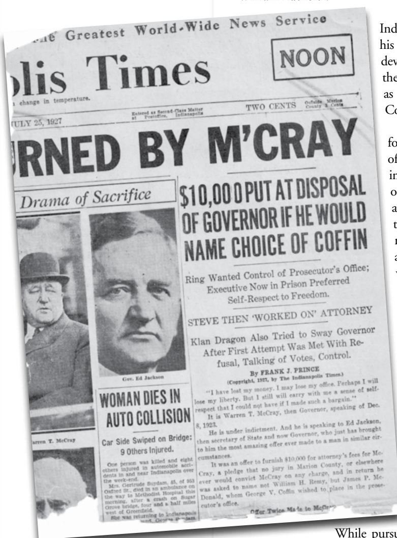
The Indianapolis Times, July 25, 1927

While pursuing this argument, however, McCray galvanized his position against the Klan. He announced that Klansman could not parade in public streets while wearing disguises. A few of Indiana's mayors agreed with McCray, but most ignored the governor's advice. Soon the Klan was parading through cities and towns all over > continued on page 2