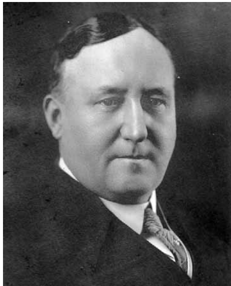
Warren T. McCray, a photograph he used in his campaigns.