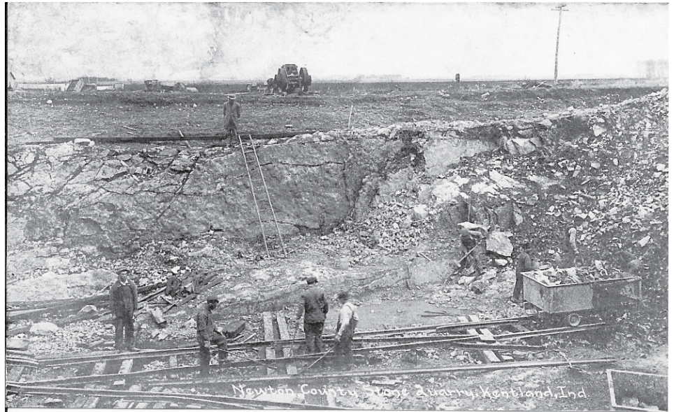
An early photograph of the Newton County Stone Quarry at Kentland.

We also could use some help transcribing records for placement on our web site. This can be done from your home - anywhere in the world if you have internet access! Send us an email if you can help newtonhs@ffni.com or call us at 219-474-6944