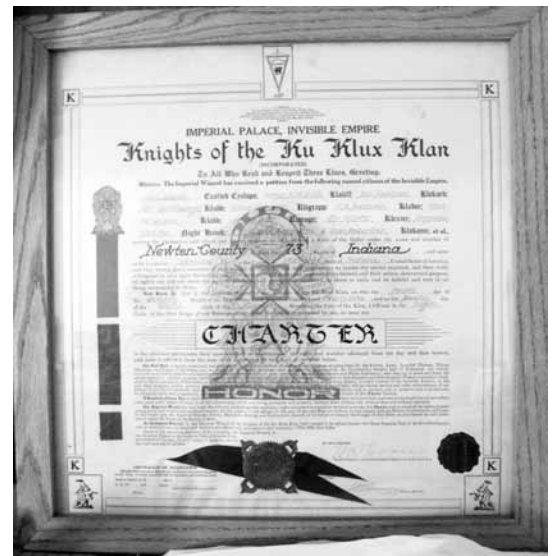
The original Charter for the Morocco Knights of the KKK is in storage at the Newton County Historical Society Resource Center.

Doleful: Stands for 4th day of the month; Woeful: Stands for 1st week of the month; Hideous: 3rd month of the year. Reign of our Reincarnation and Eight Cycle: Years were reckoned according to reigns and cycles: the Reign of Incarnation was all time up to the American Revolutionary War; the First Reign of our Incarnation was between the Revolution and the establishment of the original Klan in 1866; The Reign of our Second Incarnation was between 1866 and 1872; Reign of the Third Incarnation began in 1915. The Klan year began in May of each year and the cycle was reckoned from December of each calendar year.