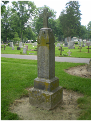
west & south sides